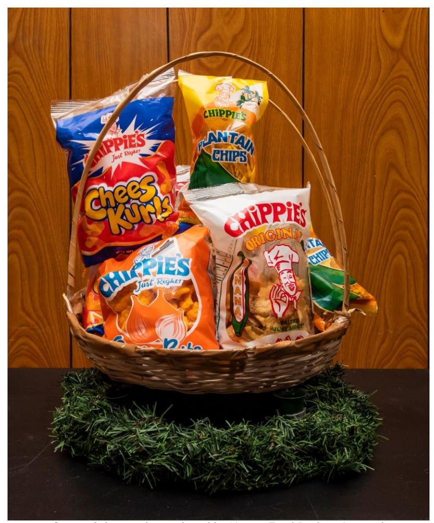
Some of the snacks produced by Native Food Packers Limited